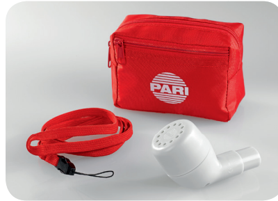
Item No. 018G5000